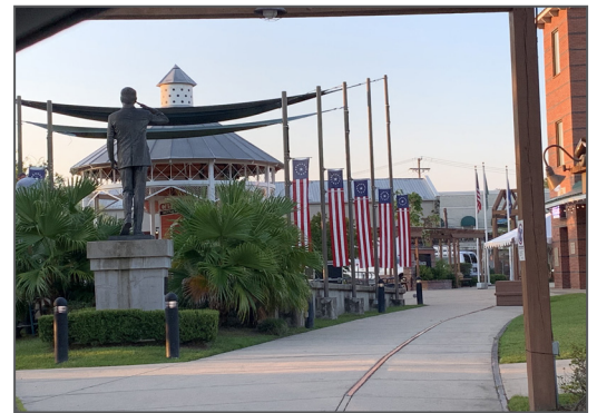
Trailhead looking from Lockwood