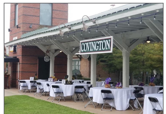
Setup for Reception at the Trailhead