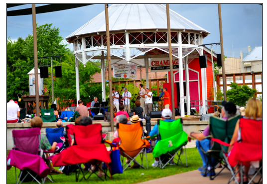
Concert at the Trailhead